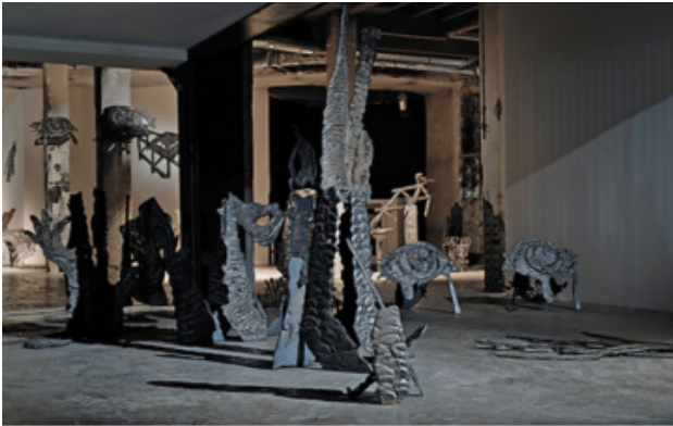
View of « Jean-Marie Appriou : Sonde d'arc-en-taupe » (Mole's Rainbow Ring), 2014, Palais de Tokyo, Paris, Photo : Aurélien Mole.

JEAN-MARIE APPRIOU'S anarchic, witchy work is simultaneously heroic and humble. His deeply strange forms—some mythical, some near kitsch—are created through processes involving the intuitive handling of traditional materials including bronze, ceramic, glass, and, next up, marble. He is by no means the first contemporary artist to reclaim such substances, yet Appriou's approach is unique: Rather than collaborating with skilled craftsmen, celebrated foundries, or high-tech laboratories, the French-born artist adopts an emphatically DIY method. More interested in alchemy than in artisanship, he manipulates these materials on his own, allowing his hands-on, trial-and-error experiments to foster intimate (if accident-prone) relationships with them.