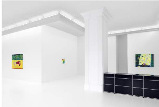
Installation view of "Shota Nakamura: dear moon" 2021.